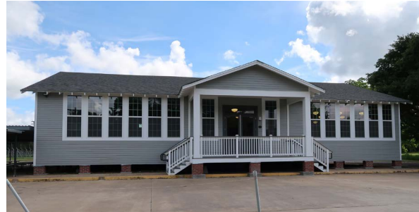
Plaisance Rosenwald School

Perhaps the ultimate example of the power of a single funder in education is not new at all: from 1914–1931, Sears Roebuck President and philanthropist Julius Rosenwald—inspired by Booker T. Washington of the Tuskegee Institute—funded through his foundation the construction of nearly 5,000 schools in the Black rural South, which went on to serve approximately 36 percent of Black school-aged children in the region. Like The NEA Foundation’s community schools (see “ Strengthening schools ”), Rosenwald schools were driven by and for communities. Research credits Rosenwald schools with 30 percent of the sizable educational gains Black students made during that period as well as a 35 percent gain in wages for Southern Black people relative to Southern white people over the longer term.